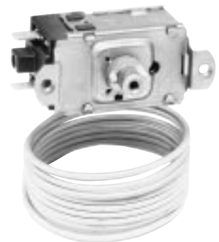
GENERAL ELECTRIC HOTPOINT